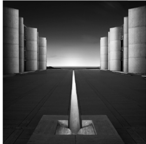
SALK INSTITUTE LA JOLLA, CALIFORNIA- BLACK & WHITE VERSION