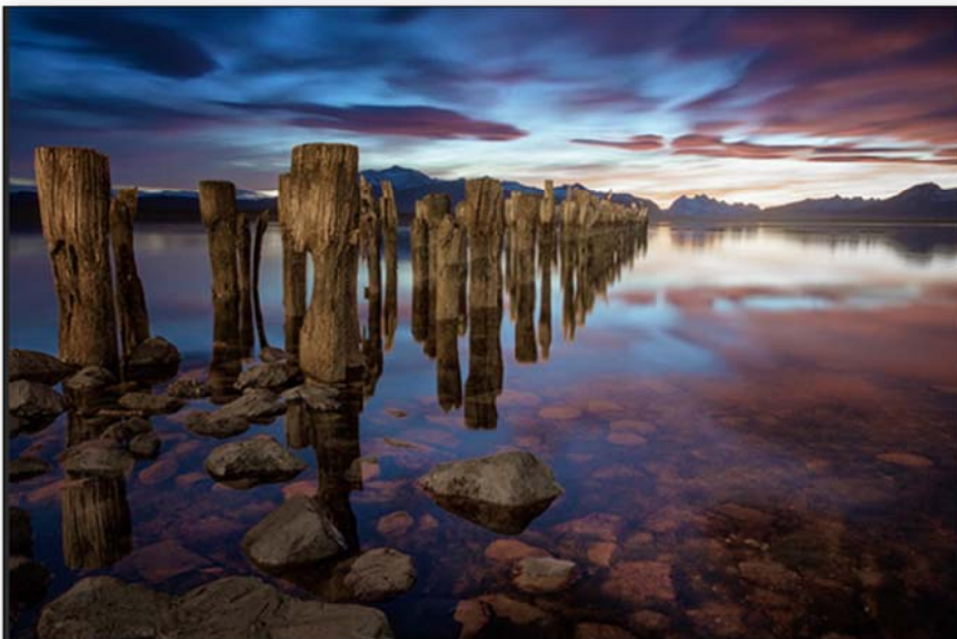
Image created by blending two exposure with luminosity masks, one for the sky and one for the foreground.

The talk and demonstration on Luminosity Masks will be followed by that introducing you to Actions, which are a powerful way to create and automate tasks at the simple click of a button. One such action that will be demonstrated is that of creating a Luminosity Mask action, which when played will lay at your disposal that you have learnt earlier. Having done so you can then tweak your image to professionally create the look and feel you wish.